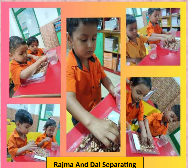
Rajma And Dal Separating Competition