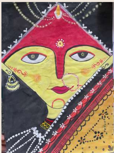
Prachi Shukla VII-C