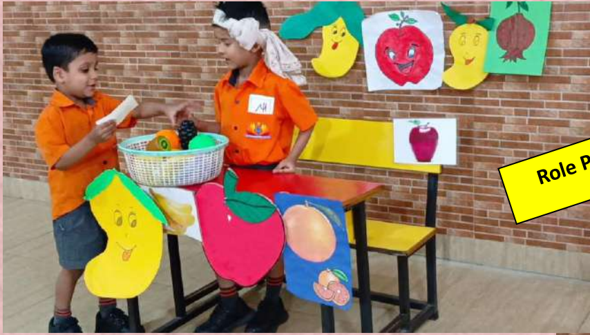
Role Play Activity