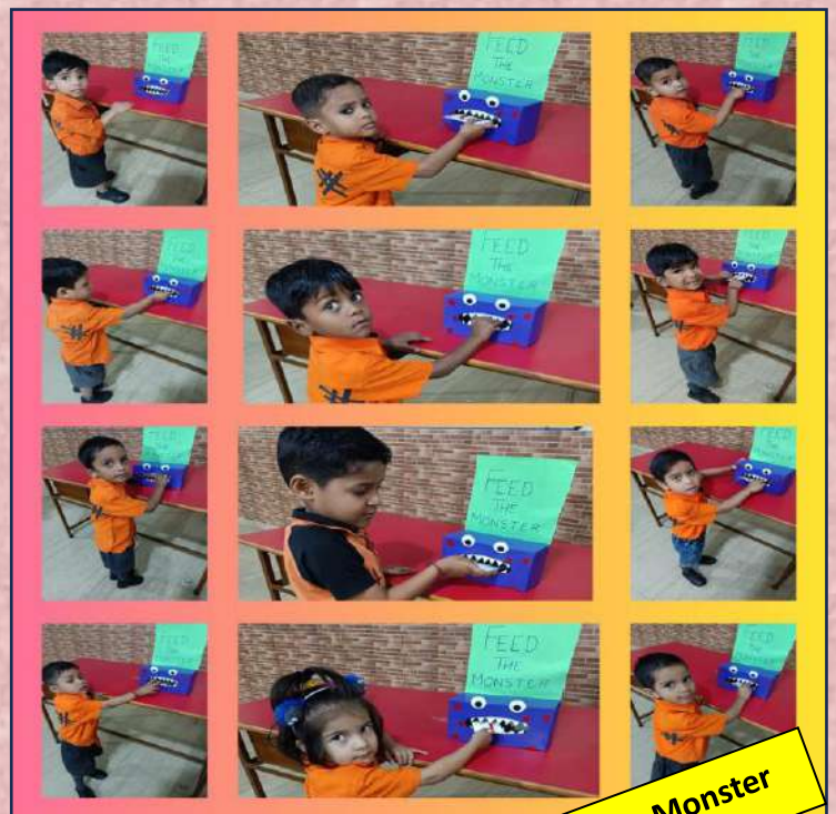
Feed the Monster