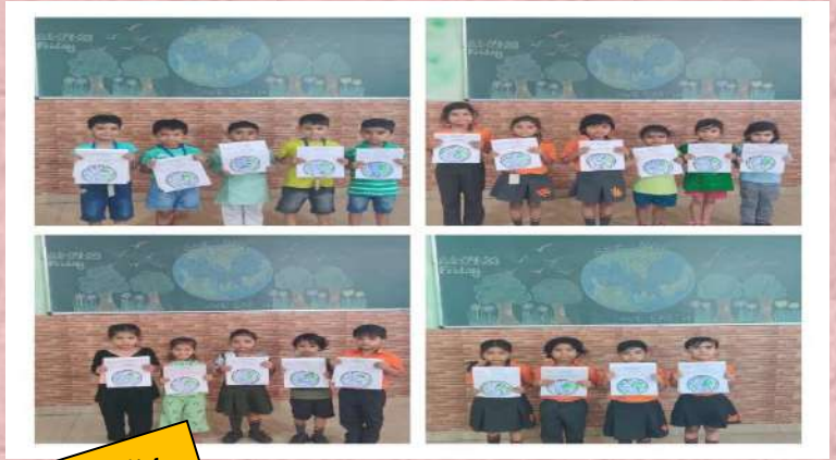
Earth Day Activity